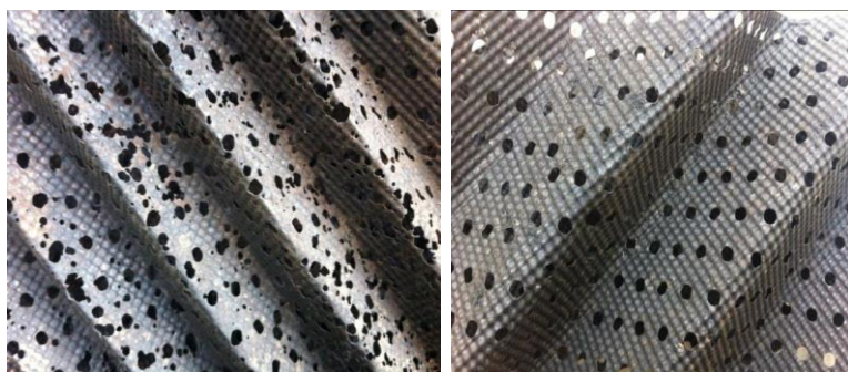
Corrosion Rate in FeCl 3 317L packing that has been used for 4 years 317L+CTS packing that has been used for 4 years

Correspondence to: zhaoxy@candortech.com